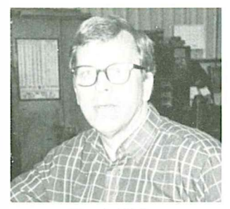
Chuck Klein Tool & Die

Pictured below are four employees who recently entered apprenticeship programs: